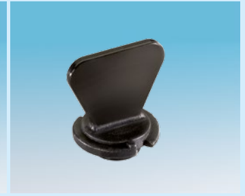
Air inlet valve for basket fitting

Party-KEGs from SCHÄFER: simply knock in the tap and the fun can begin: Enjoy tapping fresh draught beer.