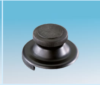
Air inlet valve for flat fitting