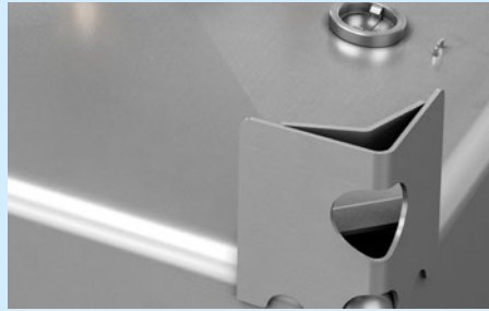
Stacking brackets and crane lifting lugs